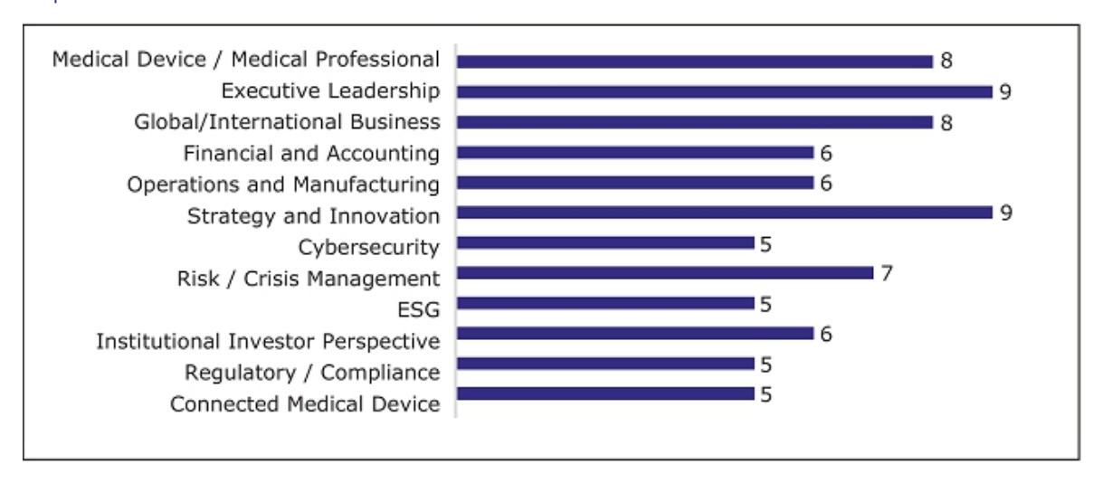
Proposal 1: Election of directors